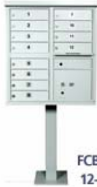
FCBU Type II 12-box Unit