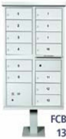
FCBU Type IV 13-box Unit