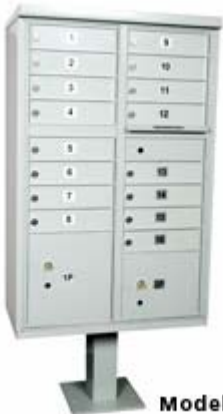
Model 1570 (F) CBU