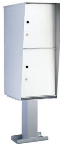
OUTDOOR PARCEL LOCKER