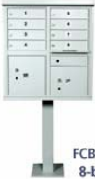
FCBU Type I 8-box Unit

- STANDARD MOST COMMONLY INSTALLED UNITS -